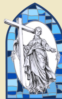
SAINT ELEANOR CATHOLIC CHURCH

I confess to almighty God and to you, my brothers and sisters, that I have greatly sinned, in my thoughts and in my words, in what I have done and what I have failed to do, through my fault, through my fault, through my most grievous fault; therefore I ask blessed Mary ever Virgin, all the Angels and Saints, and you, my brothers and sisters, to pray for me to the LORD our God.