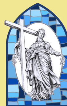
SAINT ELEANOR CATHOLIC CHURCH

I confess to almighty God and to you, my brothers and sisters, that I have greatly sinned, in my thoughts and in my words, in what I have done and what I have failed to do, through my fault, through my fault, through my most grievous fault; therefore I ask blessed Mary ever Virgin, all the Angels and Saints, and you, my brothers and sisters, to pray for me to the LORD our God.