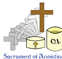
Sacrament of Anointing