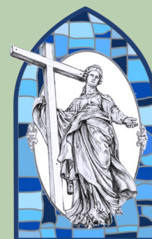
SAINT ELEANOR CATHOLIC CHURCH

I confess to almighty God and to you, my brothers and sisters, that I have greatly sinned, in my thoughts and in my words, in what I have done and what I have failed to do, through my fault, through my fault, through my most grievous fault; therefore I ask blessed Mary ever Virgin, all the Angels and Saints, and you, my brothers and sisters, to pray for me to the LORD our God.